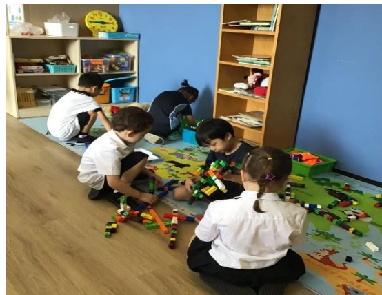
We play nicely with our friends.