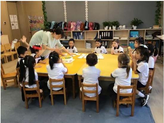
Singing 'Happy Birthday' and eating cake.