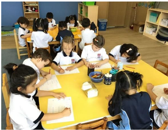
Practising writing our numbers.

It's already the second week of school! The first week was exciting as the students got familiar with their new surroundings and they were really excited to be at school. We got to know more about one another and learnt the class routine as well as meet all the teachers. I wish the students all the best for the year and remember the sky is the limit!