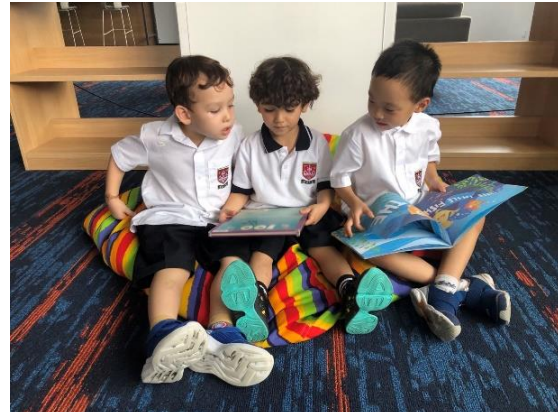
We read and share stories with our friends.